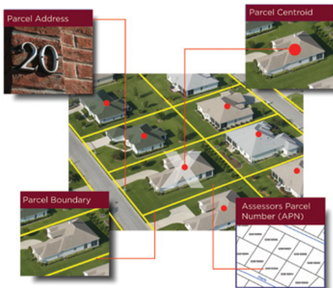
The defining elements of ParcelPoint create a powerful data set for unparalleled positional accuracy.