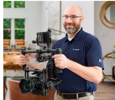
HD Video Production