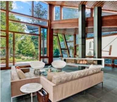
Fusion Photography SM

HomeVisit harnesses the power of virtual tours, Fusion Photography SM , 3D modeling, aerial imaging, HD video production, and high-quality printed material to advance the art of real estate marketing. With HomeVisit, listings get the special treatment competitive markets demand.